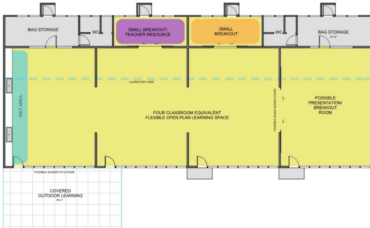
Figure 1: Avalon Block FLS upgrade Option 1

Option 1 consists of four interconnected classrooms equivalent in size with two shared bag storage rooms, shared toilets and two small breakout rooms.