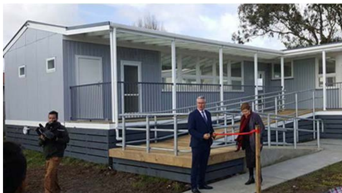
Local MP Kelvin Davis cuts the ribbon for the Puna Reo

These projects include affordable home ownership for needy families, plus a Puna Reo which once certificated, can accommodate up to 25 tamariki at any one time.